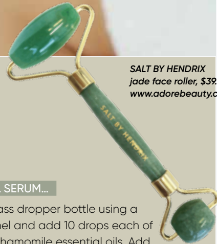
SALT BY HENDRIX jade face roller, $39.95, www.adorebeauty.com.au